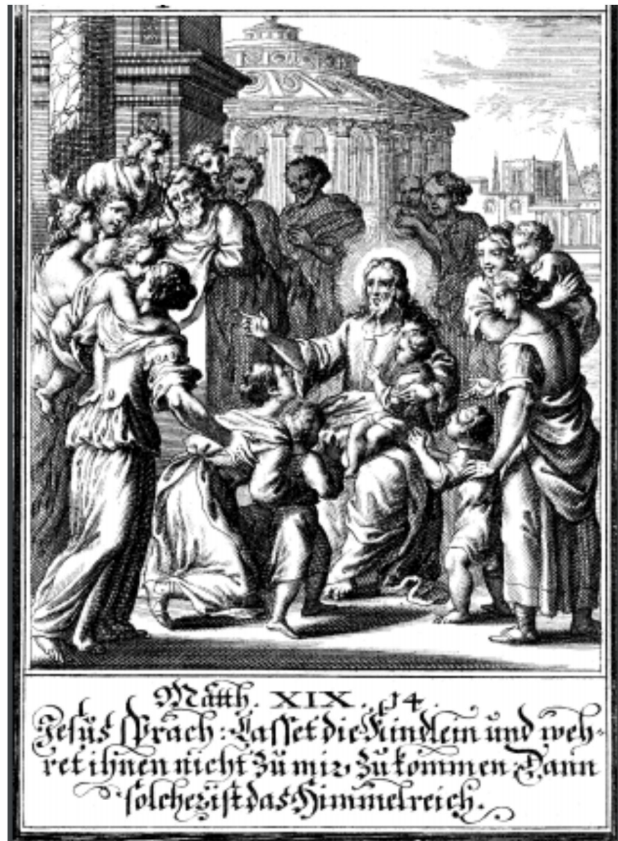
Woodcut illustration from a 1695 Bible – Mark 10: Jesus and Children

http://www.pitts.emory.edu/DIA/detail.cfm?ID=3098